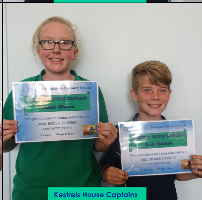
Kestrels House Captains