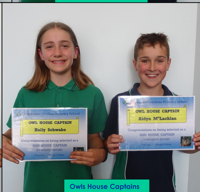
Owls House Captains