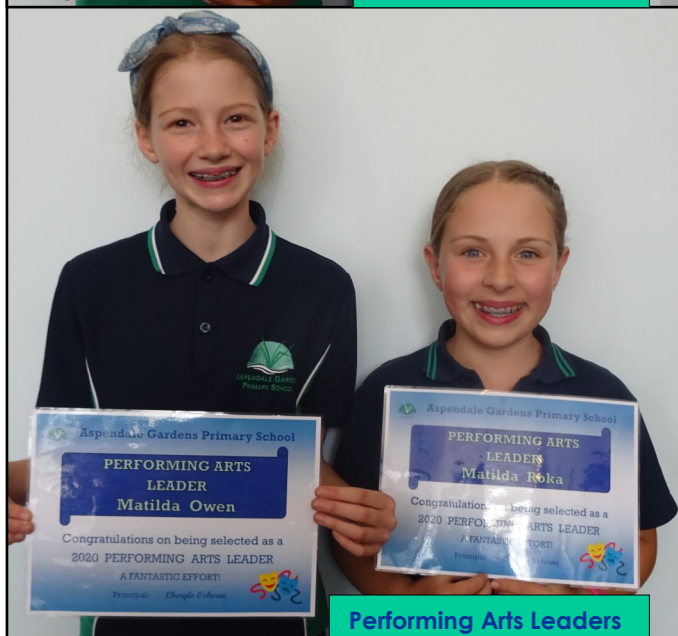
Performing Arts Leaders