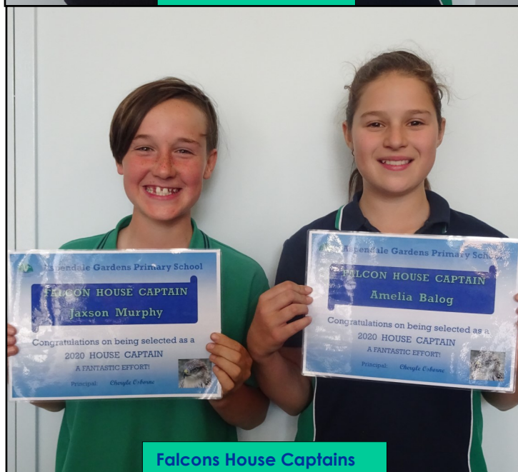
Falcons House Captains