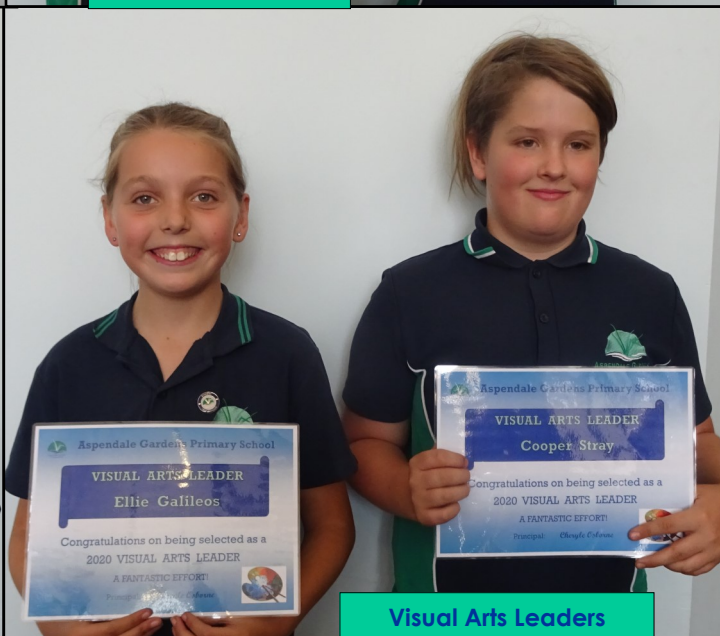
Visual Arts Leaders