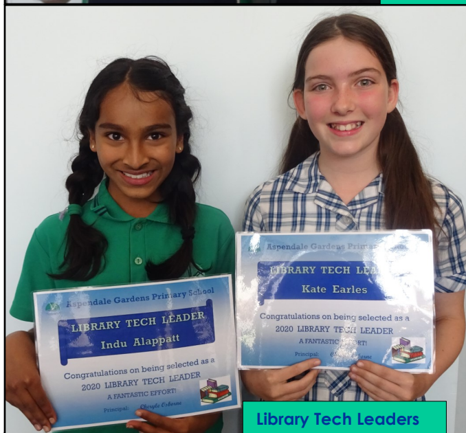
Library Tech Leaders