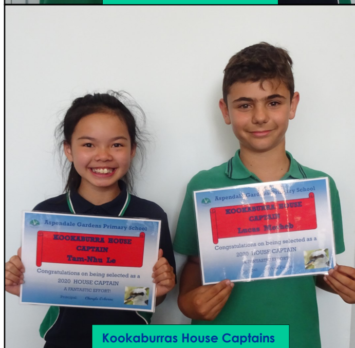
Kookaburras House Captains